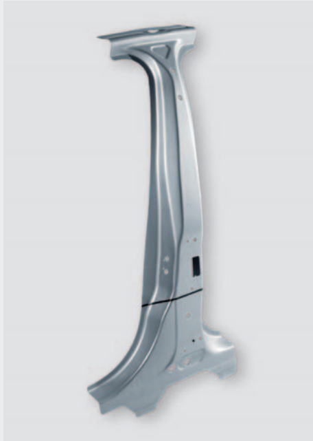
Example application B pillar