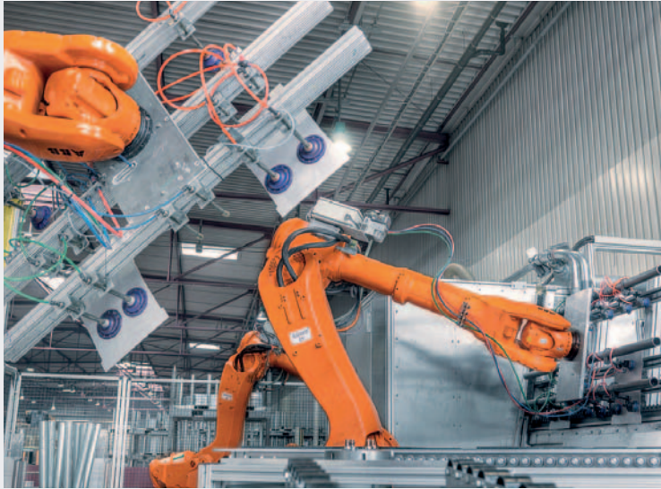
Coating removal line