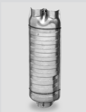
Example Exhaust system